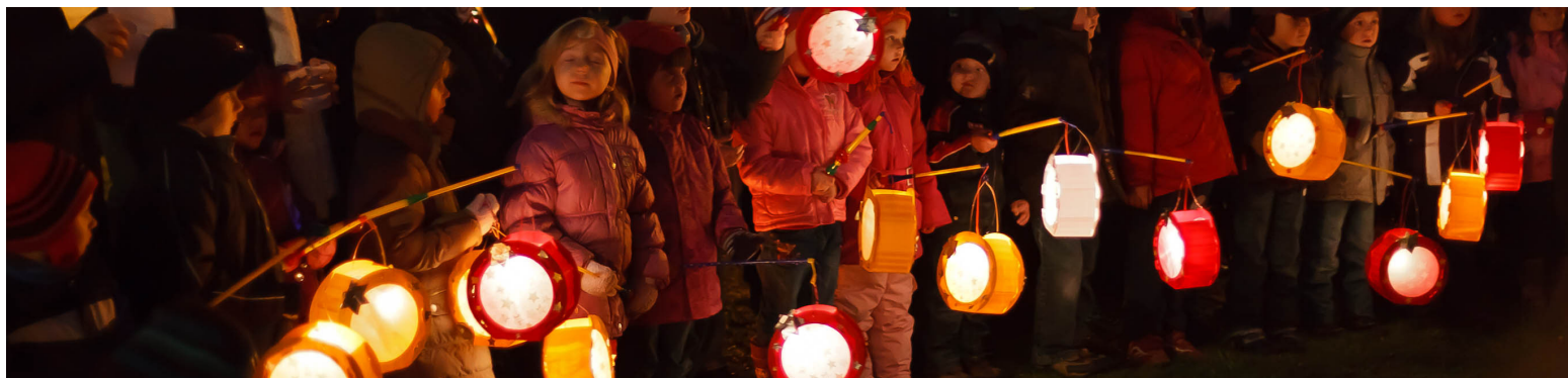
Children walk with their homemade lanterns on a stick through the streets following a man on a horse dressed as St. Martin. The walk usually ends at a bonfire, where the depiction of St. Martin sharing his coat comes alive.